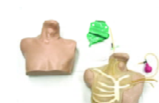
Central Line Simulator The central line simulator features carotid pulse and a flashback of synthetic blood upon correct placement of the central line.

For more information on Simulation Technology, contact: