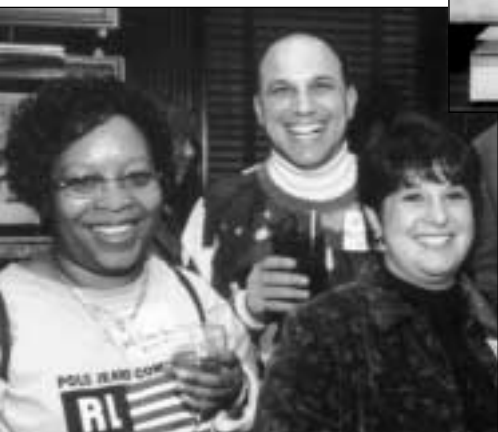
Alumni Relations, Page 4