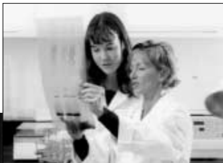
Laboratory Sciences, Page 2