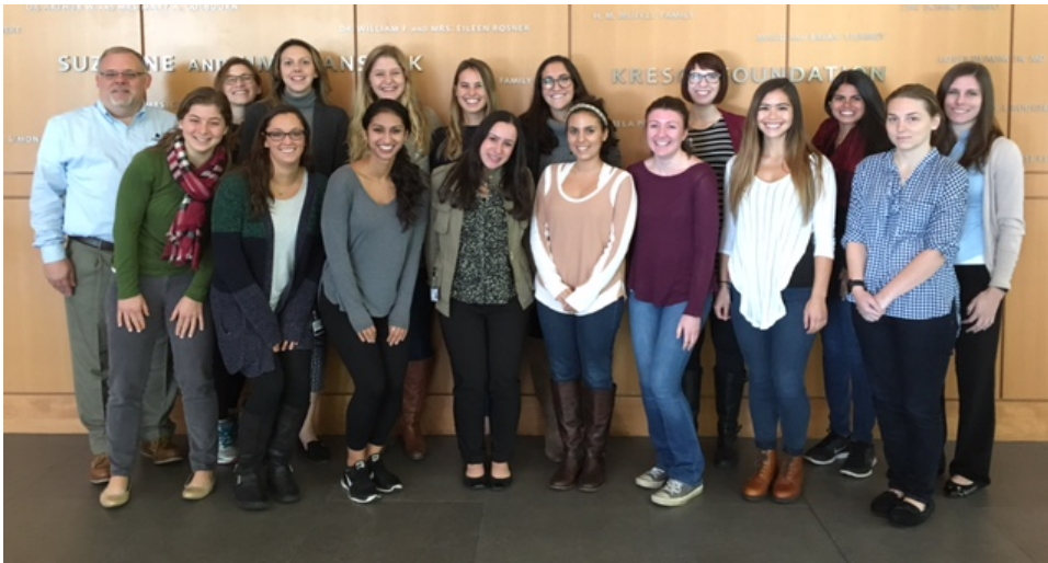
The OTD entry level inaugural class of 2019.