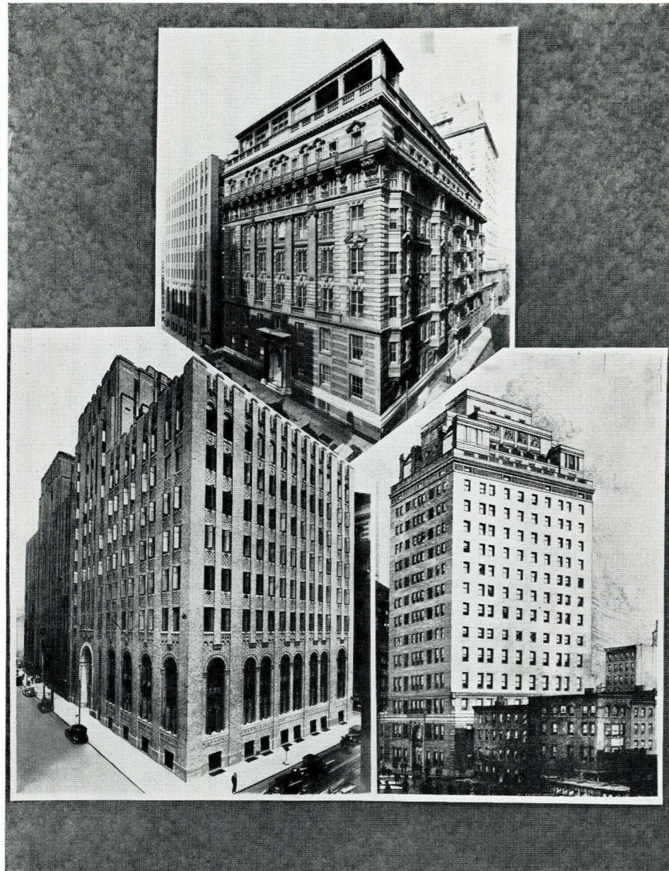
Center: JEFFERSON HOSPITAL 10th and Sansom Streets