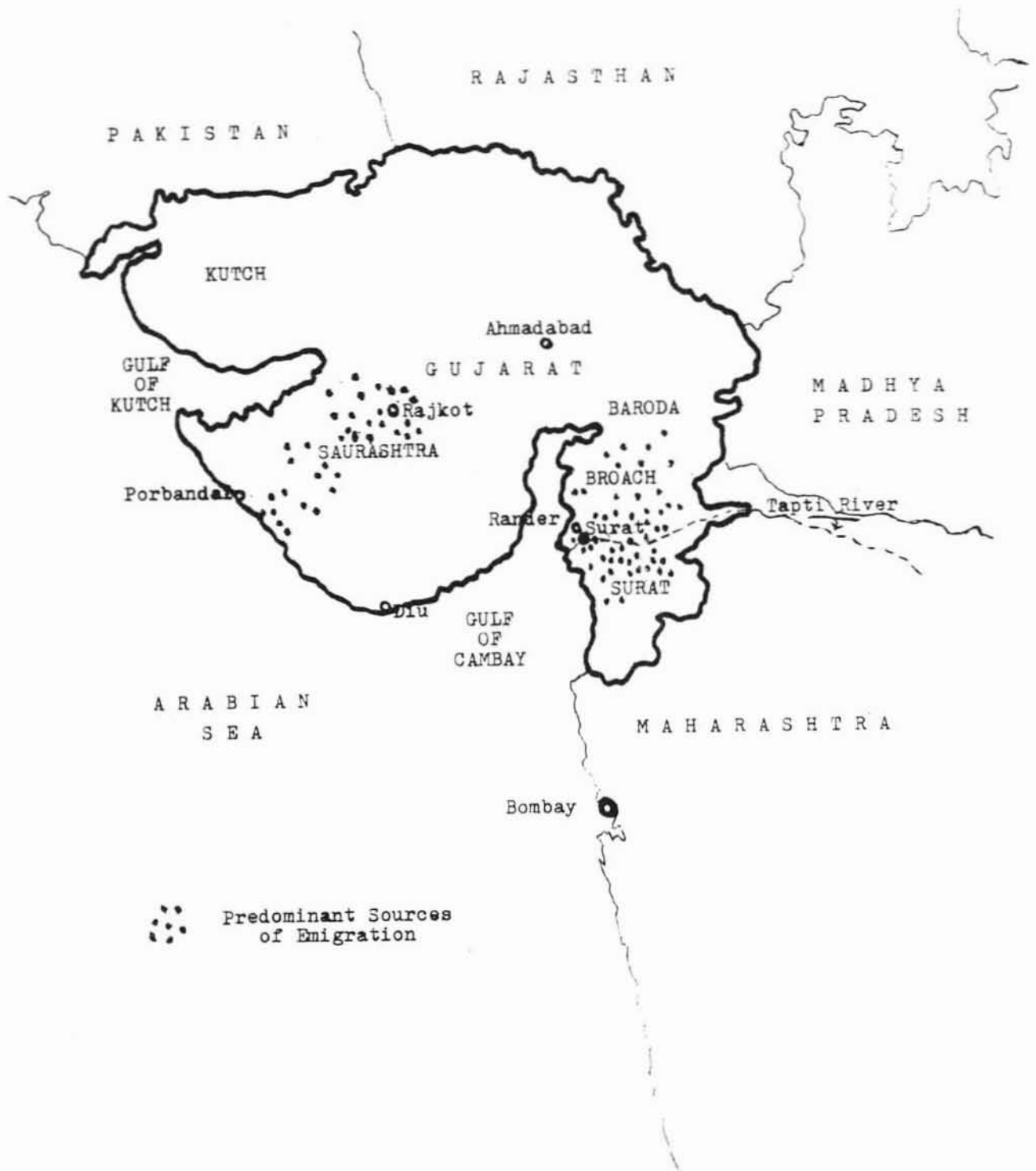
Figure 1: Gujarat