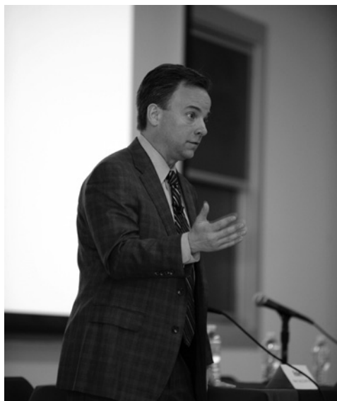
Mark McClellan, MD, PhD, Director of the Engelberg Center for Health Care Reform at the Brookings Institute speaks to a full house in the Connelly Auditorium.