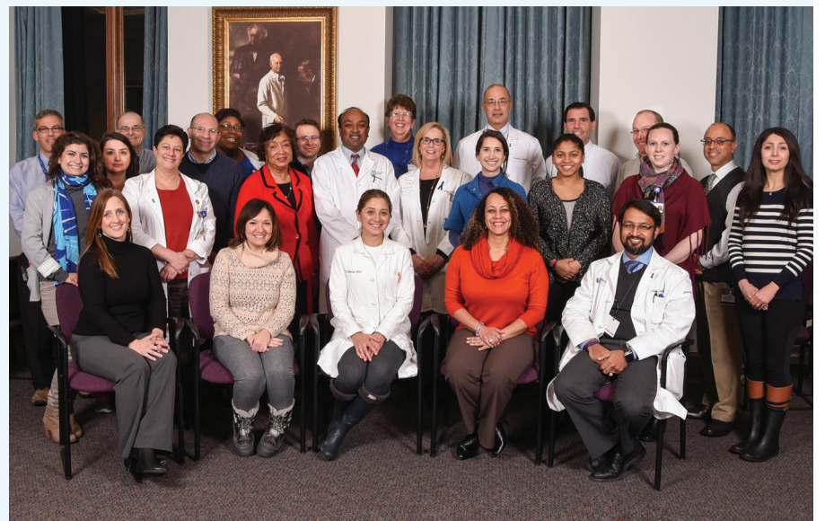
Our multidisciplinary pancreatic cancer team includes surgeons, GI specialists, medical oncologists, radiation oncologists, advanced practice nurses, research scientists, residents, postdoc fellows, graduate students, clinical research coordinators and nutritionists.

For more information, go to Jefferson.edu/Pancreas .