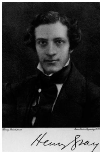
FIG. 1. Portrait of Dr. Henry Gray. Available at: http://www.sciencemuseum.org.uk/broughttolife/people/henrygray.aspx . Accessed July 30, 2015.