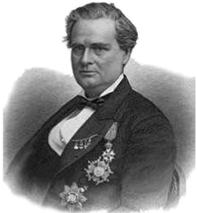
FIG. 1. Dr. J. Marion Sims, M.D., LL.D., considered by some to be the father of American Gynecology.

no particular interest in gynecology. 2, 4 In fact, the future "Father of American Gynecology" even wrote that "If there was anything I hated, it was investigating the organs of the female pelvis." 4 Everything changed in 1845 when he was summoned to care for a woman who had fallen off a horse and injured her pelvis. 3, 4 Through digital examination, Dr. Sims found that she had a retroverted uterus. He placed the patient in a lateral decubitus position, her knees touching her chest, the Sims position (Fig. 2), enabling him to return her uterus to its original position. 1, 4 He was so excited about this discovery that he immediately went to a hardware store to buy a pewter spoon, which he then proceeded to bend into the first version of a Sims speculum (Fig. 2). 3, 4 Later, upon examining a slave with a vesicovaginal fistula through the use of his eponymous position and speculum, Dr. Sims wrote, "I saw everything as no man had ever seen before. . . I