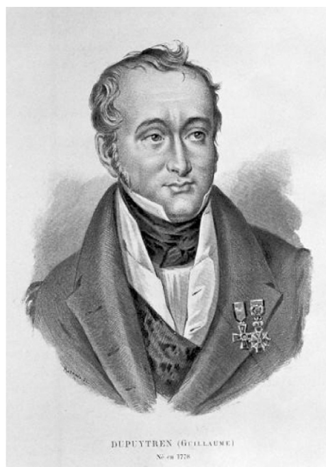
FIG. 1. Lithograph of Guillaume Dupuytren.

Although his peers and his students were able to look past his unprofessional behavior, his controversial actions toward his patients may have led Dr. Dupuytren