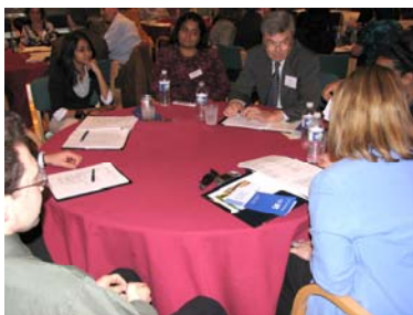
Roundtable discussion with students, faculty, and CAB

On May 28th, the MPH CAB had its annual Spring meeting and students and faculty alike were invited. The purpose of the meeting was to update our CAB about all of the changes in the program and the progress we have made.