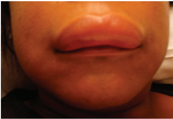
Figure 1. Angioedema confined to the upper lip.

sect bites; consumption of food precipitants (bananas, shrimp, peas, grapes, etc); illicit drug use; herbal medications; and food or drug allergies.