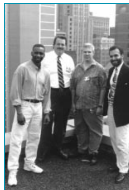
AISR's STAR AV team