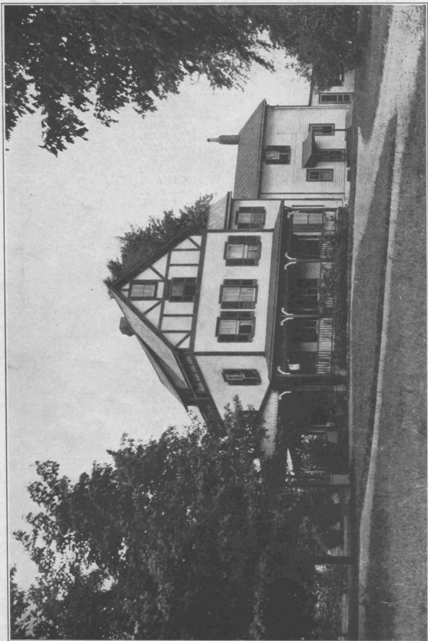
IVYCROFT FARM Convalescent Home for Men of Jefferson Hospital