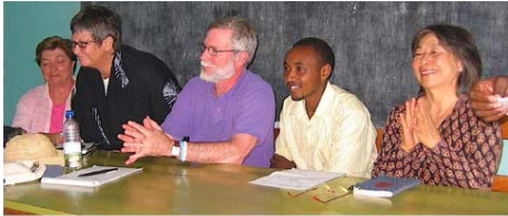
Survivor's Village Town Meeting

A Jefferson group will be returning in early April '07 to assist in the formal dedication of the Genocide memorial, follow-up on the nutrition assessment/activities and determine next steps for collaboration, including meeting with faculty from the Rwan-