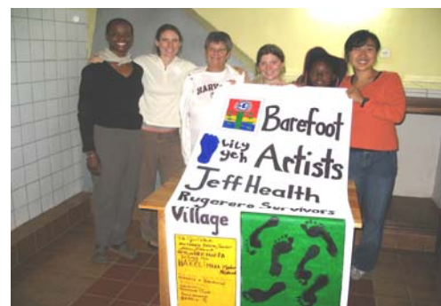
Rwanda Health & Healing Project Team

In October of 2005, the Office to Advance Population Health and a team of