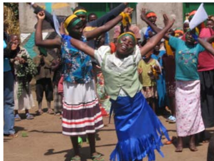
Survivor's Village Children Festival

dan Schools of Medicine and Public Health.