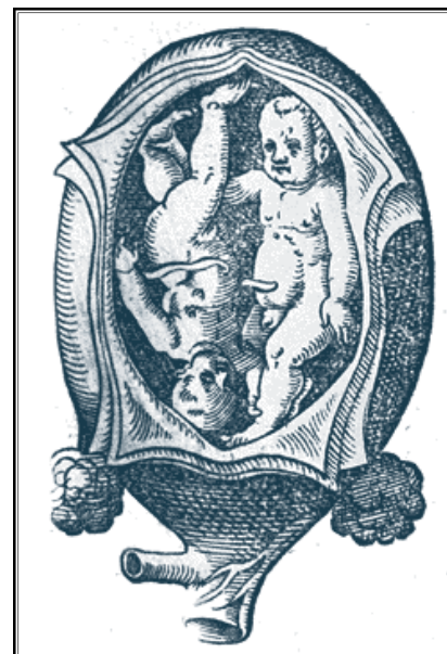
Jakob Rueff, 1587 De conceptu et generatione hominis

From the Special Collections of Scott Memorial Library