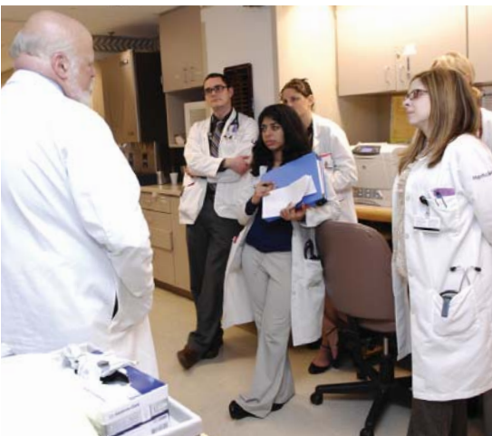
“Huddles” are being used to streamline inpatient care and reduce patients’ length of hospital stay. Attendings, house staff, nurse managers, therapists, and case managers convene each morning to improve communications and efficiency.