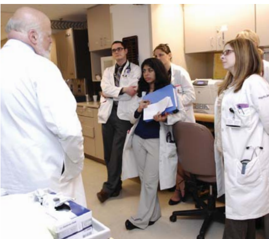
“Huddles” are being used to streamline inpatient care and reduce patients’ length of hospital stay. Attendings, house staff, nurse managers, therapists, and case managers convene each morning to improve communications and efficiency.