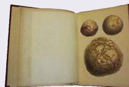
On the Anatomy of the Breast (1840) [overview of open book]

As an initial component of the Jefferson Digital Commons, what was once a scarce book, too fragile to handle, and requiring a trip to a rare book reading room, is now accessible to a world-wide audience.