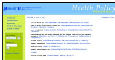
The JDC provides a home for Jefferson electronic publications, such as Health Policy Newsletter.

Do it for fame and glory. Studies have shown that articles to which access is freely available are cited earlier--and more often--than articles that are not, so you benefit directly from increased exposure. So does your department.