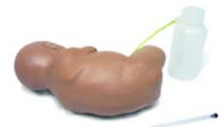
Infant Lumbar Puncture Simulator Baby Staph provides an opportunity to practice lumbar puncture on an infant with synthetic spinal fluid return.