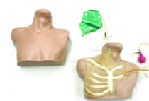
Central Line Simulator The central line simulator features carotid pulse and a flashback of synthetic blood upon correct placement of the central line.

For more information on Simulation Technology, contact: