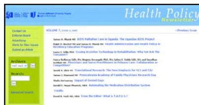
The JDC provides a home for Jefferson electronic publications, such as Health Policy Newsletter.

Look for Scopus under "Core Resources" on the JEFFLINE homepage at: http://jeffline.jefferson.edu/