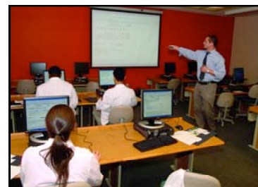
Most AISR workshops are held in the Scott Library Learning Resources Center, Room 306

Each Fall and Spring, AISR conducts a variety of workshops for Jefferson faculty, staff, and students. Below are just a few of the workshops we offer in the areas of Information Searching Skills and Instructional Technology . Look for an AISR Workshops brochure in your mail every August and December. For complete schedules and online registration, go to: http://jeffline.jefferson.edu/workshops.html