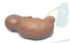
Infant Lumbar Puncture Simulator Baby Staph provides an opportunity to practice lumbar puncture on an infant with synthetic spinal fluid return.