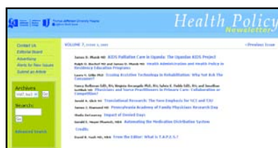
The JDC provides a home for Jefferson electronic publications, such as Health Policy Newsletter.

Look for Scopus under "Core Resources" on the JEFFLINE homepage at: http://jeffline.jefferson.edu/