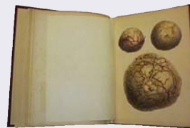
On the Anatomy of the Breast (1840) [overview of open book]

As an initial component of the Jefferson Digital Commons, what was once a scarce book, too fragile to handle, and requiring a trip to a rare book reading room, is now accessible to a world-wide audience.