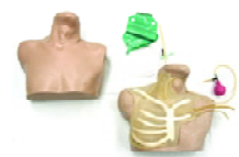
Central Line Simulator The central line simulator features carotid pulse and a flashback of synthetic blood upon correct placement of the central line.

For more information on Simulation Technology, contact: