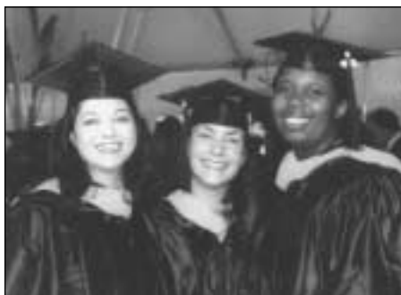
Commencement, Page 5